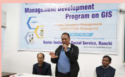
One Week MDP on “GIS for Land Resource Management” for Tata Steel Managers

XISS, Ranchi, on the request of TATA Steel, organized a One Week Management Development Programme on “GIS for Land Resource Management” in the GIS Lab, XISS from 29 January to 2 February 2024. The event saw enthusiastic participation from Managers from Tata Steel. The Management Development Programme (MDP) commenced with the inaugural remarks of the Director, XISS who warmly welcomed the participants and said that XISS's continuous commitment to promote applications of latest technological practices while planning business decisions is important in today's time and this MDP marks the first series of MDP for Tata Steel Managers.