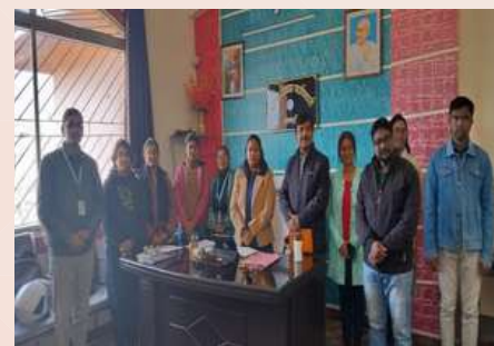
Students of the Rural Management Programme participate in Block Placements

Block-level Placement is an integral part of the Rural Management Programme course curriculum. The objective of block placement is to provide an opportunity to the students to observe and learn the practical aspects of different government programmes and schemes for sustainable community development at the Block level. The Block placements for 1st-year students of batch 2023-25 were held from 22 to 29 January 2024. Students were divided into seven groups and placed in different blocks of Ranchi district under respective Block Development Officers (BDOs). The blocks were Kanke, Ratu, Ormanjhi, Nagri, Itki, Angara, and Namkum. Students observed, learnt, and understood the aims and objectives of different programmes and schemes like MGNREGA, PMAY, SRLM, DDU-GKY, NSAP, etc., for poverty alleviation, livelihood and employment generation, and providing social security for the rural people and other interventions to uplift the economic condition of people living in rural areas of the Ranchi district of Jharkhand. Students submitted a report based on their observations and learning to the Block Development Officer after the completion of their study. Block Placement students were done under the supervision of Dr Pawas Suren and Dr Sanjay K. Verma.