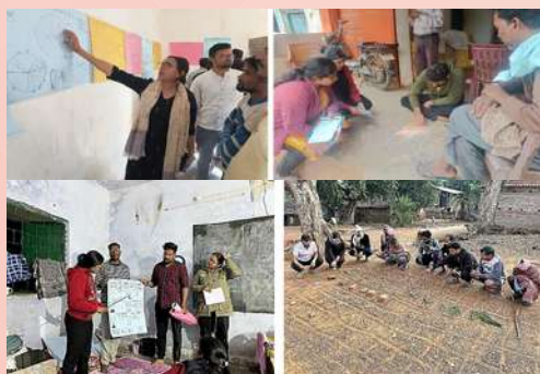
Rural Camp organised for Rural Management Students