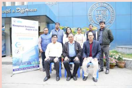
One Week MDP on "GIS for Land Resource Management" for Tata Steel Managers