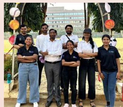
Students participated in Rann-X-Bhoomi - XIMU's Annual Sports Competition

Students participated in sports such as Women's Badminton, Men's matches, and Mixed Doubles matches featuring XISS and XIM. The players as individuals and teams put in commendable effort. The mixed doubles team from XISS secured victory in the quarter-finals, showcasing their skill and determination. In the closing ceremony, noted Indian Parabadminton player Pramod Bhagat felicitated the winners.