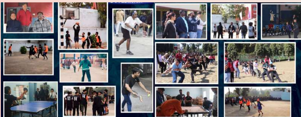
Games and Sports Week Ignites Campus Spirit!

XISS, Ranchi, organised its 'Games and Sports Week' from 1-3 February 2024 in the campus. Several sporting events were organised for students, faculty, and staff to showcase their athletic prowess. Director, XISS addressed the fervent crowd and said that it is a proud moment to inaugurate games and sports for the year 2024. He mentioned that sports are all about physical, mental, and emotional skills. It is all about discipline and sportsmanship and one should play the games in all fairness despite the outcome.