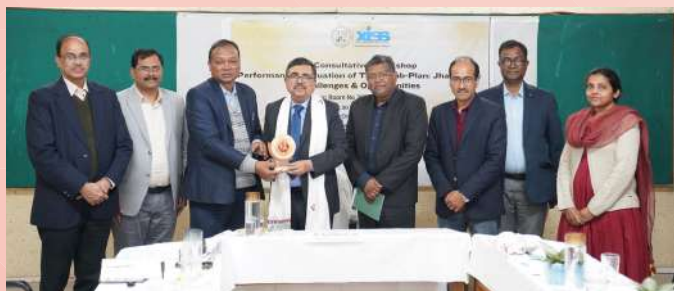
Workshop on “Performance Evaluation of Tribal Sub-Plan: Jharkhand: Challenges and Opportunities”