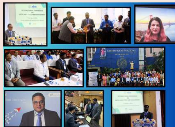
Experts come together at International Conference on Data Analytics and Management

https://xiss.ac.in/readmore/experts-come-together-at-international-conference-on-data-analytics-and-management