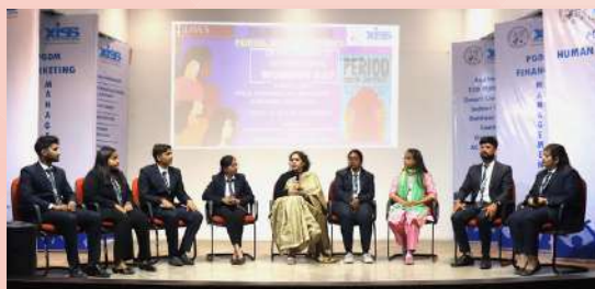
International Women's Day 2024 celebrated

XISS Ranchi, in collaboration with the Indian Association for Women's Studies (IAWS), commemorated International Women's Day 2024 with a thought-provoking film screening event in the Michael Van den Bogaert SJ Memorial Auditorium on 8 March 2024.