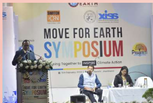
XISS & SwitchON Foundation organizes "Move for Earth Symposium 2024"

XISS, Ranchi and SwitchON Foundation in a collaborative effort jointly organised, "Move for Earth Symposium 2024" to address pressing environmental challenges and inspire collective action towards sustainability in the XISS Campus. Recognizing the urgent need for action in both rural and urban areas, stakeholders from across the state of Jharkhand convened at the symposium which aimed at fostering collective efforts for positive change. The event saw active participation from multiple sectors including Government, Industries, NGOs, Academia, and others.