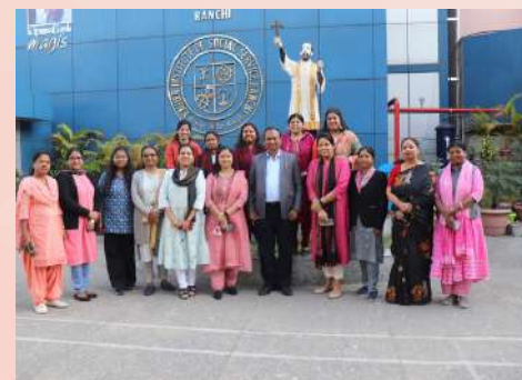
International Women's Day 2024 celebrated