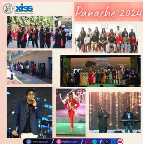
"PANACHE 2024: Annual Fest of XISS culminated in a spectacular celebration!"

XISS successfully organized its annual fest, 'Panache 2024,' on the theme '52 Deck of Cards,' from 9-10 February 2024. The event featured a diverse array of activities and competitions engaging participants from various colleges. Director, XISS, inaugurated the fest and emphasised that Panache represents a confident and stylish approach to tasks perceived as distinct and it is heartening to see the students organise such a wonderful event annually.