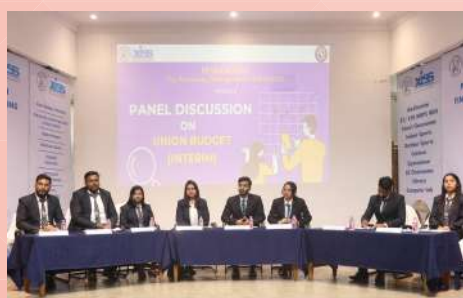
"Insightful Conversations: Panel Discussion Analyzes Implications of Union Budget"

XISS, Ranchi, organised a panel discussion on the Union Budget for the financial year 2024-25 at Fr Michael Van den Bogaert SJ Auditorium. The event was organized by the Marketing Management Programme and MarkBuzz Club of XISS.