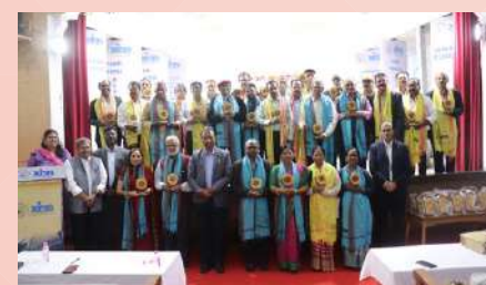
Overwhelming Alumni Reunion of Rural Development Batch of 1982-84